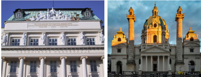
TU Wien, main building (left) and Karlskirche (right)

TU Wien can be easily reached by public transport from the Vienna International Airport, which provides direct flights to 170 destinations worldwide.