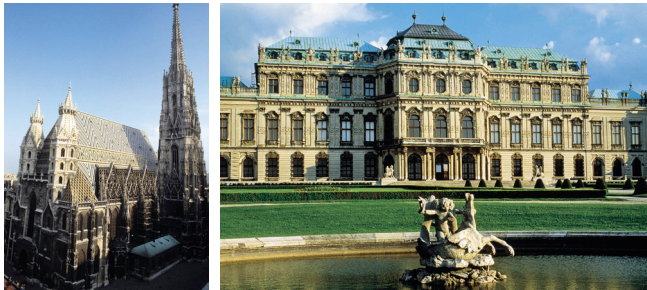
Stephansdom (left) and Belvedere (right)